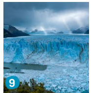
9 Glacier .....