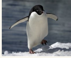
5 (Adelie) penguin .....