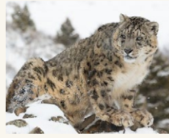
3 Snow leopard .....