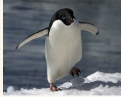
5 (Adelie) penguin .....