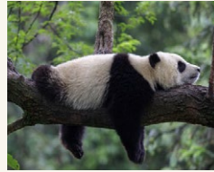
3 Panda .....