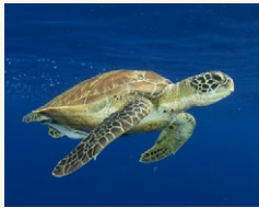
4 (Green) turtle .....