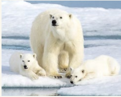
1 Polar bear .....