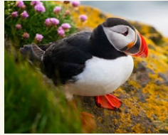
2 Puffin .....