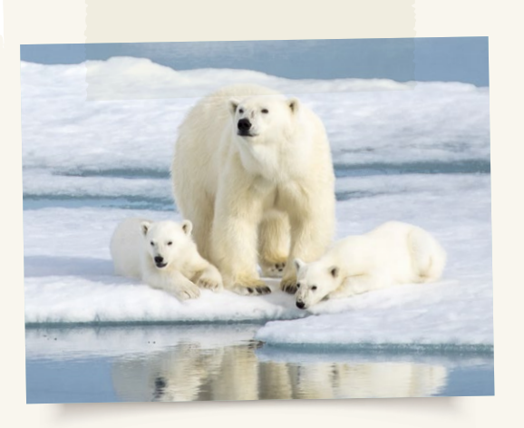
Imagine you are a polar bear living in an area where you can no longer get onto the sea ice to hunt.

How would you feel as the fire approaches? What would you do?