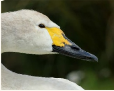
1 Bewick's swan .....