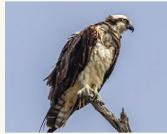
5 Osprey .....