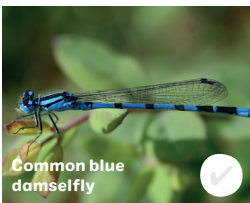
Common blue damselfly

Where to look: Listen out in grassy areas. Often well camouflaged. When disturbed, they'll jump!