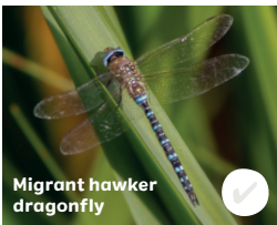
Migrant hawker dragonfly

Where to look: Clinging to vertical surfaces like trees or buildings. Although common, they're sometimes hard to see.