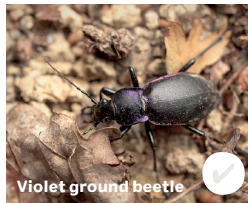
Violet ground beetle

Where to look: Seen delicately flying around wetlands and perching on plants near water. Weaker fliers than dragonflies.