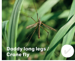
Daddy long legs / Crane fly

Where to look: Often found crawling around on plants, especially ones where aphids live - their favourite food.